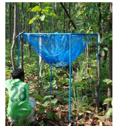
Integrated observations system concept